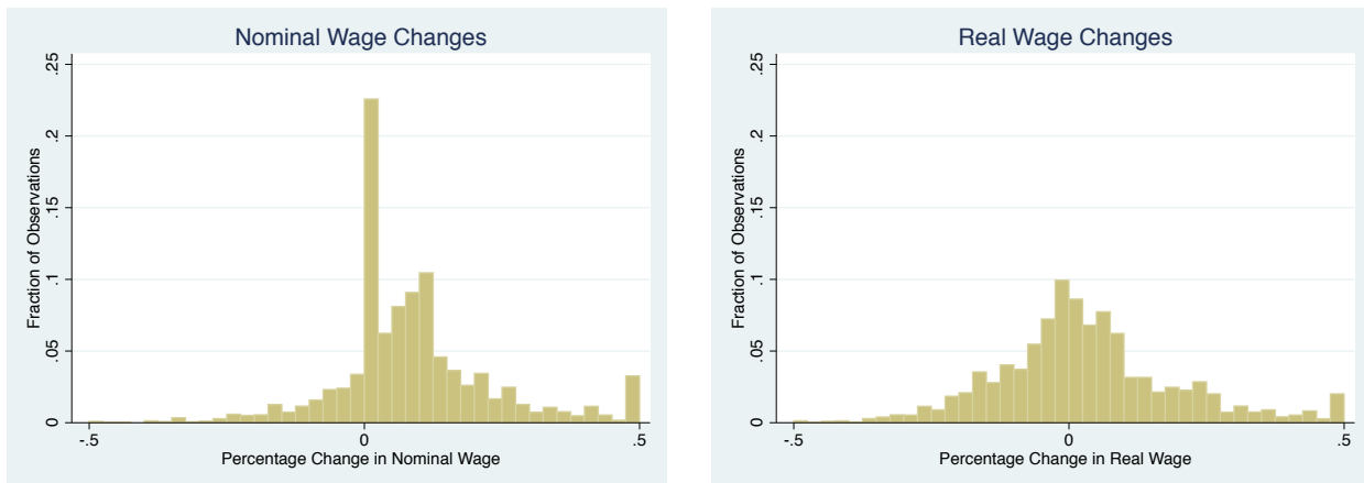
Figure 2 – Distributions of Wage Changes